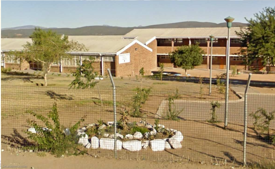
This is what Bongoletu Primary School looks like from the roadside

We go to school by foot. We there are \pm 46 learners in a classroom. We have 24 teachers at our school. We have a soccer field and we have a computer lab and a net ball field. We have a rugby field a net ball field and a office.