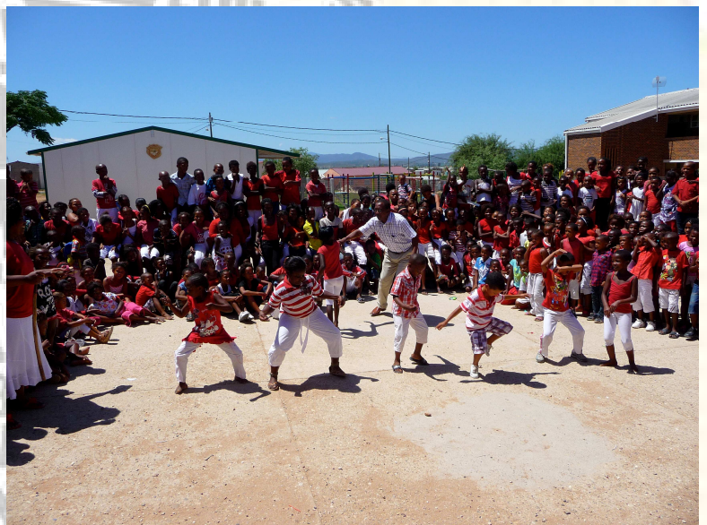
A dancing competition at the schoolyard