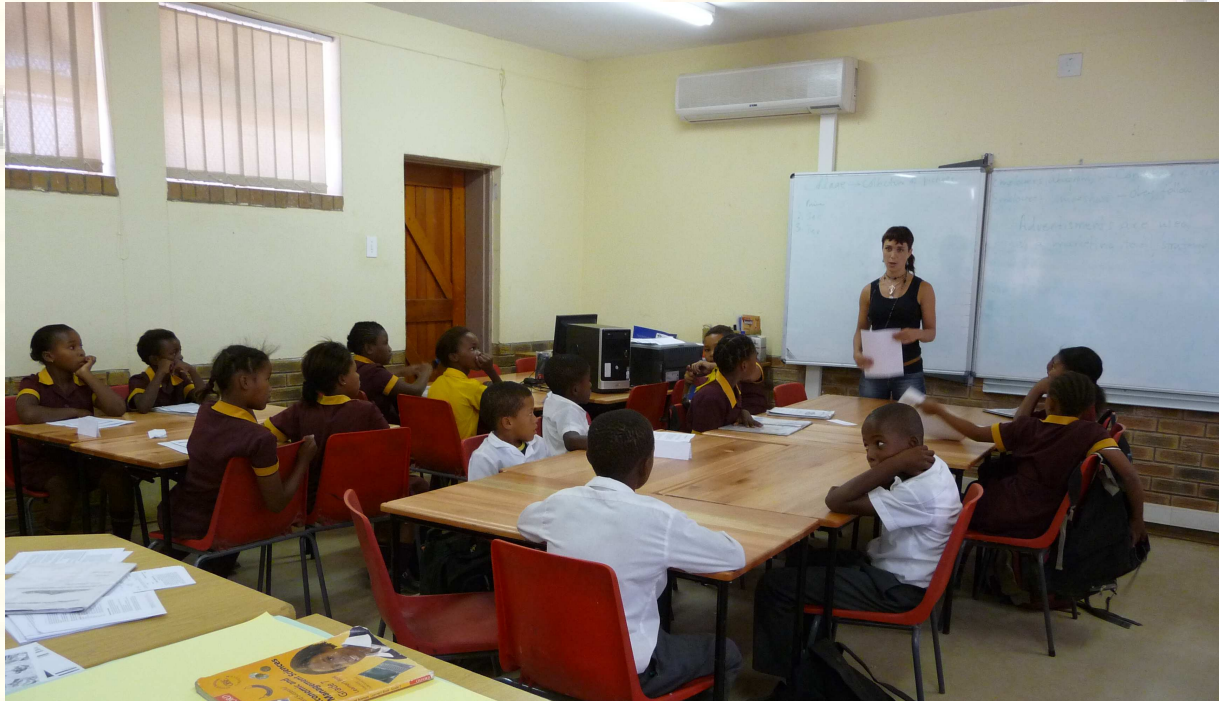
This picture is during one of the newsletter exchange lessons