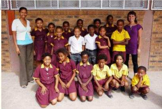
Participants from Bongolethu Primary School