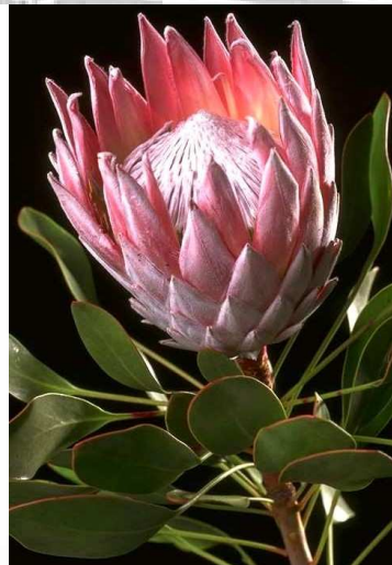
The Protea flower is our national flower.