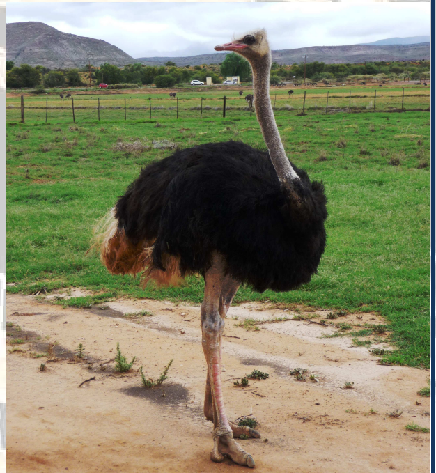
Oudtshoorn is famous for its Ostrich farms and is the Ostrich capital of the world.

The town, Oudtshoorn is in a province called Western Cape. It is very hot here in summer and very cold in winter, but we don't get any snow. Here in Oudtshoorn we actually talk only three languages, Afrikaans, English and Xhosa. We can learn you Xhosa here in Oudtshoorn. You can come and visit us for the holidays.