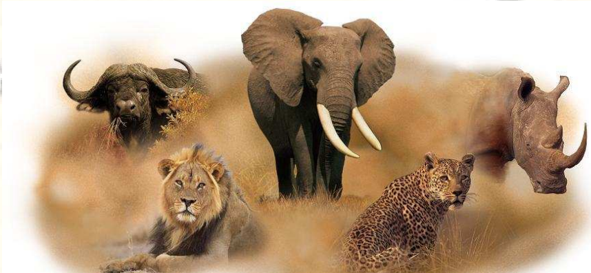
Buffalo – Lion – Elephant – Leopard - Hippopotamus