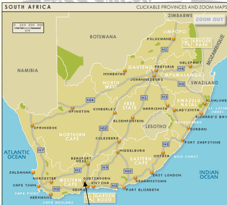
Oudtshoorn is a province in the Western Cape.

We don't like our country because it is too dirty and the people like to fight, but we like all the animals in our country.